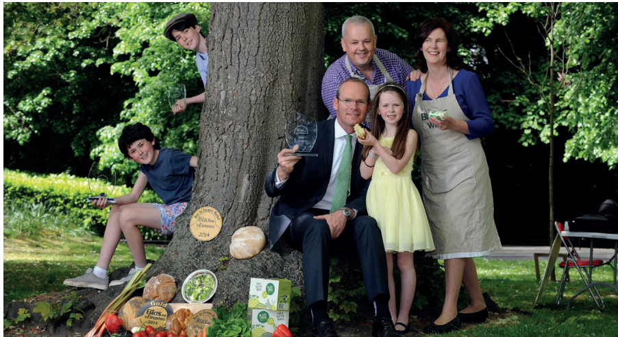
Minister Coveney pictured at the launch of the Blas Na hEireann Irish Food Awards 2015

I would like to thank the passionate and talented food producers from across Ireland who work hard to put the finest Irish produce on the map.