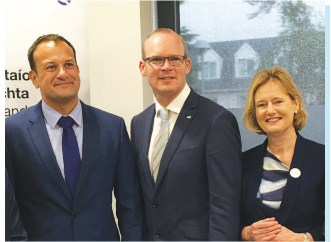
Pictured with Minister Leo Varadkar and Senator Deirdre Clune and the opening of the 60th Intreo office in Carrigaline.